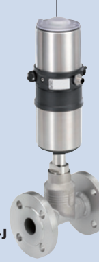
Valve system Continuous ELEMENT Type 8802-GD-L 2301 + 8694

If you click on any of the "More info" orange boxes below you will be taken to the product on our website where you can download the datasheet.