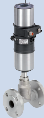
Valve system Continuous ELEMENT Type 8802-GD-I 2301 + 8692

Globe control valve with desired control unit